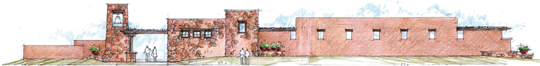
GATEWAYS FESTIVAL WALK EXTERIOR DTJ DESIGN